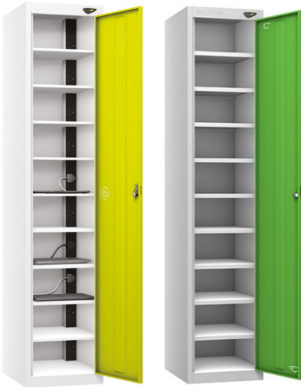
Pure Laptop Charging Lockers - 1 door - 10 compartments

Designed with 10 different compartments behind one locked door, our Pure Laptop Charging Lockers are perfect for educational settings, including schools and universities. Designed in 13 vibrant door colours, and with enough space for laptops whilst simultaneously charging them using either UK 3-Pin or USB and/or USB-C. Alternatively, a storage only option is also available.