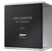
USB and USB-C Socket